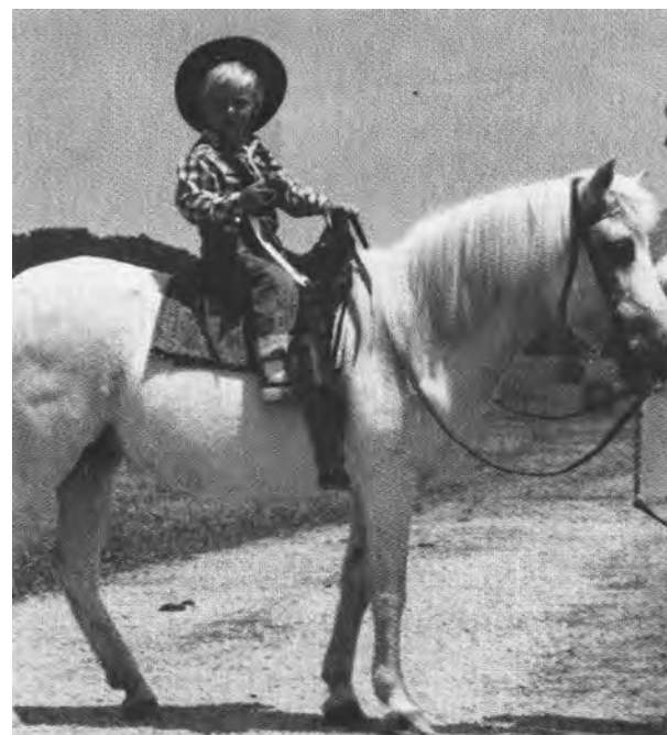
A young rider wins his first ribbon at the Barrington Junior Horse Show in 1987, sponsored by the Bit 'n Bridle Club.

To solidify this reputation, letters of opinion were sought from realtors about property values associated with organized equestrian events and the lack of restrictions for private horse ownership. A generally positive response was to spur a remarkable movement beginning in the mid-1920s of would-be country house and estate owners to the countryside all around the Village of Barrington.