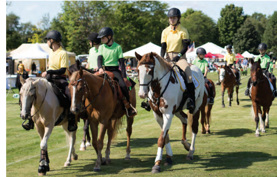
Members of the Fox River Valley Pony Club get ready to demonstrate quadrilles at the LeCompte Kalaway Trial Owners Polo Cup Matches in 2015 as a pre-game presentation for guests.