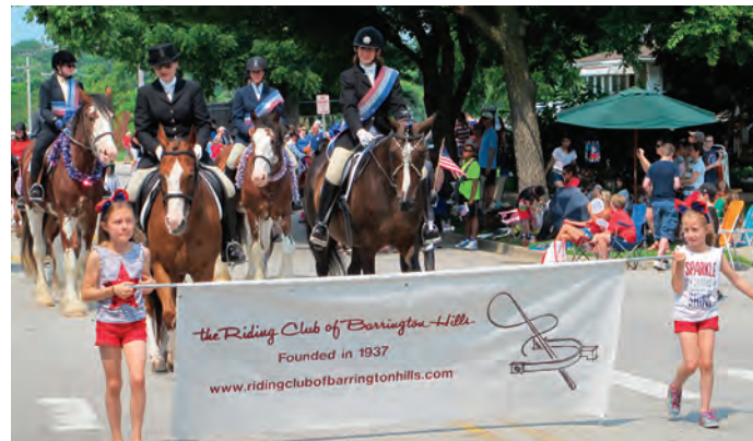
Riding Club members participate in Barrington's Fourth of July parade.